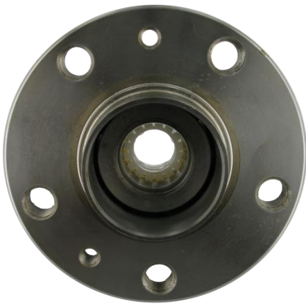
Bearing with plastic joining sleeve

SKF use safe packaging solutions to protect the wheel bearing from damage during transport or mounting. VKBA 3497 is delivered with a plastic joining sleeve, to keep the inner rings together, until the bearing is mounted on the car.