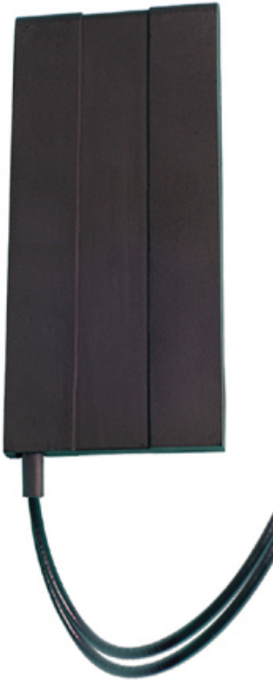
AUTA 1 DVB-T