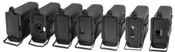
Modules: Bluetooth, DMM, ZigBee, USB, Wifi, RS232, Ethernet

The GRX Battery Diagnostic Station is designed to offer an often required level of service around the world, using switch-mode and a more scalable platform to help customize the GRX to fit any OEM or aftermarket battery management program.