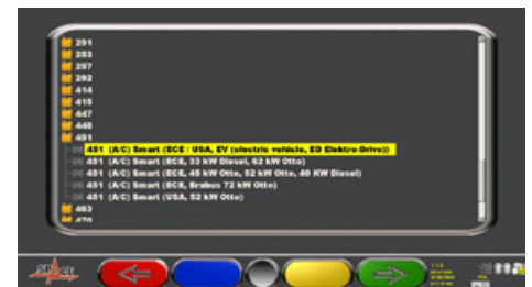
Original Mercedes database