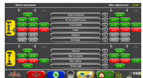
Data before and after adjustment