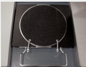
STDA134 (2 x kit) Turntables