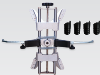
STDA46EU/3D-MB Two pair of 4-point clamps for general usage