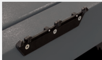
STDA117 (2 sets = 4 brackets) Two standard brackets and two extra