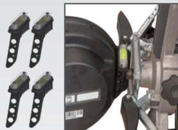
STDA149 (4 x kit) Spirit levels for targets