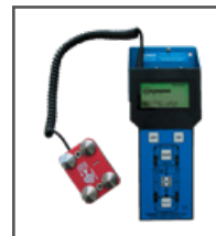
To be ordered from company Romess: ROMESS measuring device