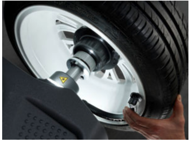
QUICK SELECTION PROGRAM (QSP) Fast and Automatic recognition of TOP3 Programs: Standard, Alu 2, Alu 3